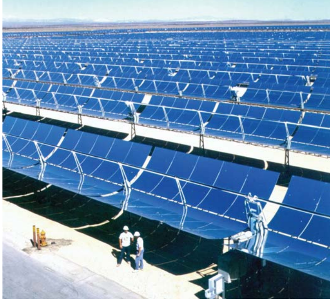
Parabolic trough mirrors with maintenance workers at Kramer Junction, California