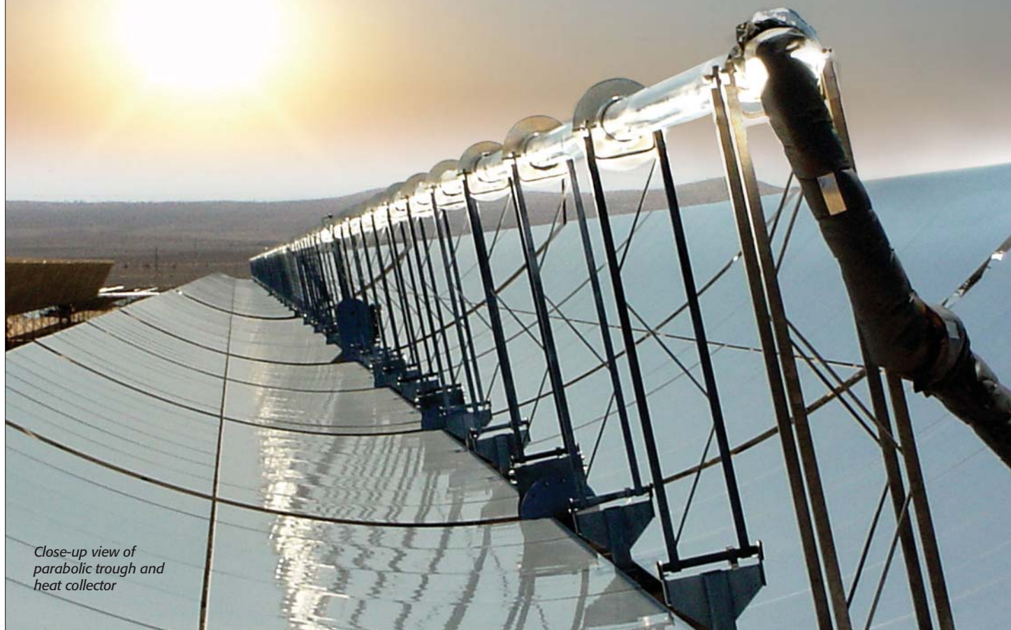
Close-up view of parabolic trough and heat collector