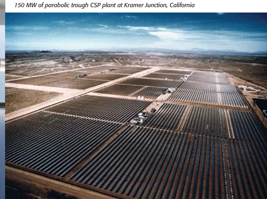
150 MW of parabolic trough CSP plant at Kramer Junction, California