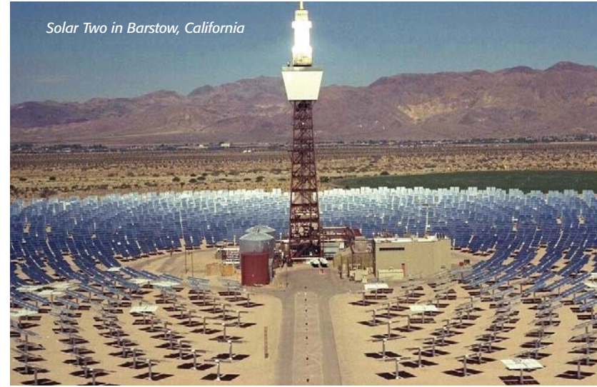
Solar Two in Barstow, California