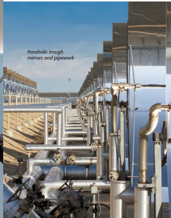
Parabolic trough mirrors and pipework